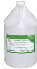
LUBRICANT, SWITCH, GLIDEX MC

Glidex® MC long-lasting synthetic switch lubricant keeps rail switches operating smoothly