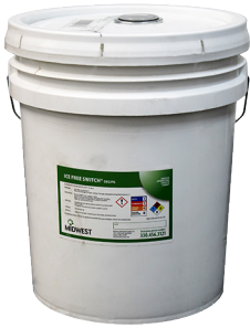
ANTI-ICER, ICE FREE SWITCH

Remains in place to activate when needed to melt falling and blowing snow preventing switches from freezing.