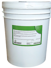
LUBRICANT, SWITCH, GLIDEX

Specially formulated synthetic lubrication that is fluid, yet remains in place once it becomes "static"