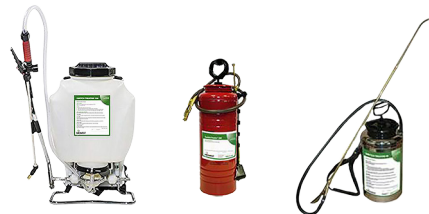
SPRAYER, SWITCH TREATER

Stainless Steel Hand Sprayer with an easy-to-use spray wand.