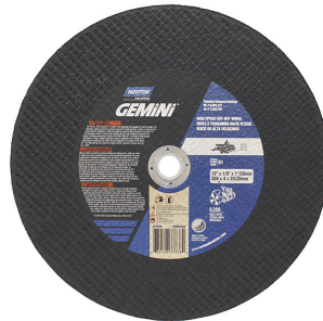
27-1070 MEULE, 11-7/8X1/8X1"/20MM (6,360 RPM)