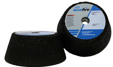
27-1120 MEULE, 5/3-3/4X2X5/8-11 (RPM 7260)