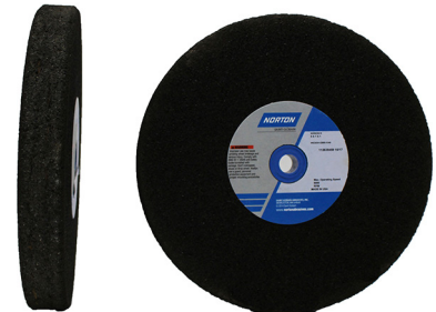
27-1050 MEULE, 8X1X1 ABRASIVE, GW (6,000 RPM)