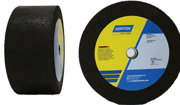
27-1030 MEULE, 6X2-3/4X5/8-11 (6,000 RPM)