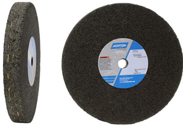
27-1020 MEULE, 8X1X5/8 4NZ1634- Q5BS-X348