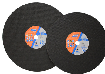
27-1900 / 27-1950 MEULE À TRONÇONNER 14X1/8X1 A48 (5,400 RPM) MEULE À TRONÇONNER 16X1/8X1 A48 (4,800 RPM)