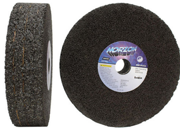
27-1060 MEULE, 8X2xw1 ABRASIVE, GW (NETTOIE TÊTE);