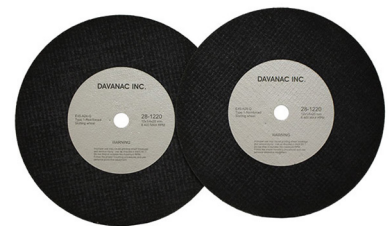
28-1220 ROUE À FENTES 12X1/4X20MM, 24Q (6,400 RPM)